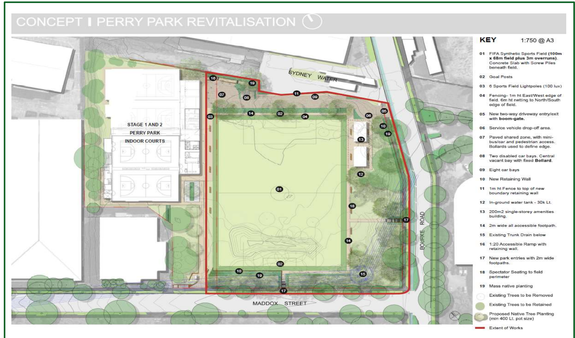
Figure 3. Concept Plan – Sports Field Precinct