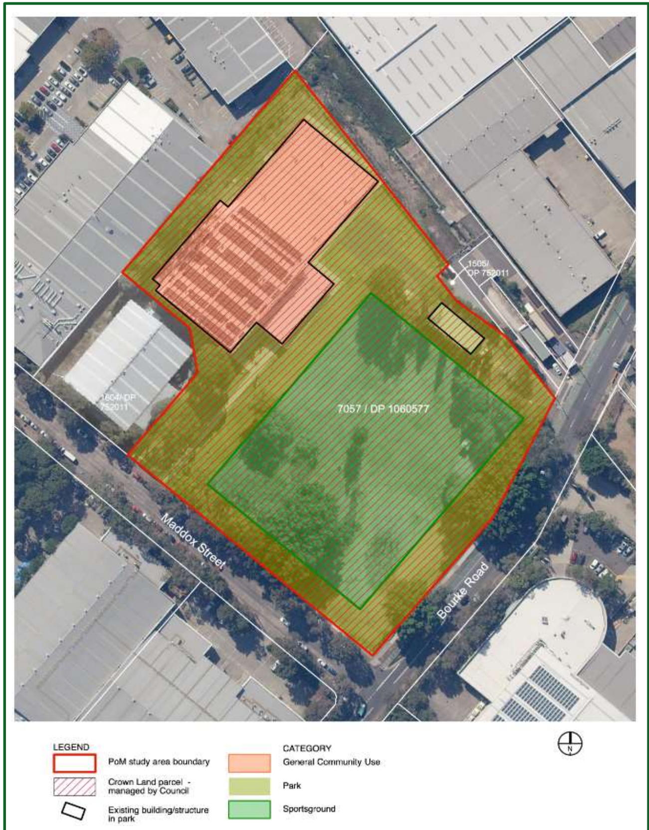
Figure 4. Community land categorisation map