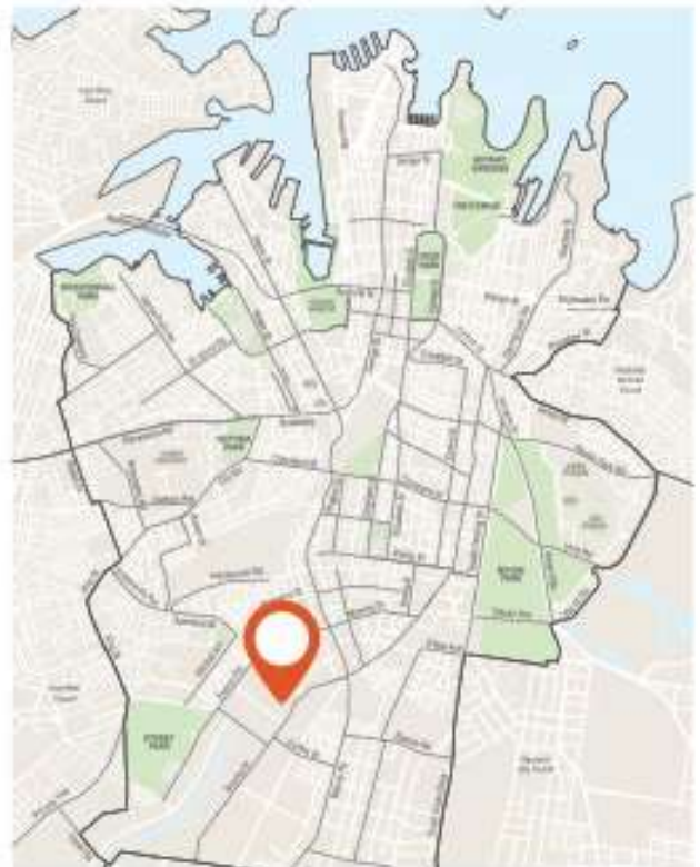
Perry Park, Alexandria