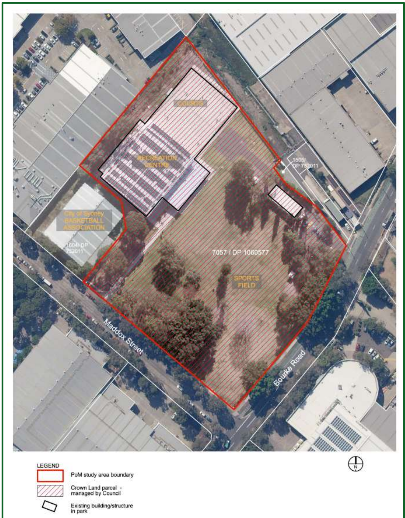
Figure 2. Site Plan